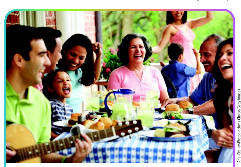
The extended family—grandparents, aunts, and uncles—can provide occasion for good times as well as an important source of security, its members helping each other, especially during crises.

Nevertheless, the extended family—including adult siblings, a family research topic very often neglected—